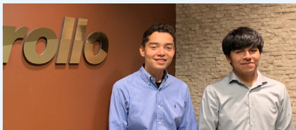
Carollo's Dallas Office Interns.