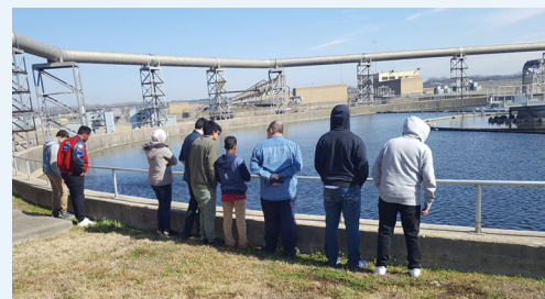
DISD students on site at Central WWTP in Dallas, Texas.

Carollo's partnership with NAF continues to allow students the opportunity to tour wastewater and water treatment plant sites. Seventy students joined Carollo Engineers and Dallas Water Utility (DWU) for a tour of Bachman Water Treatment Plant (WTP) and Central Wastewater Treatment Plant (WWTP). Carollo utilized the site visit for a near to peer presentation including a water/wastewater process overview and a discussion about operator and engineer careers.