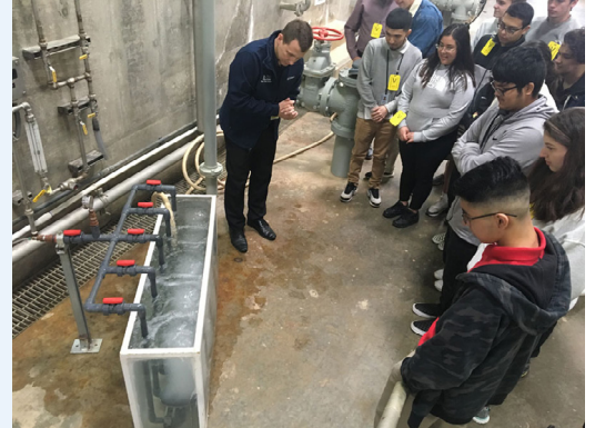
DISD students on site at Bachman WTP in Dallas, Texas. (above and below)