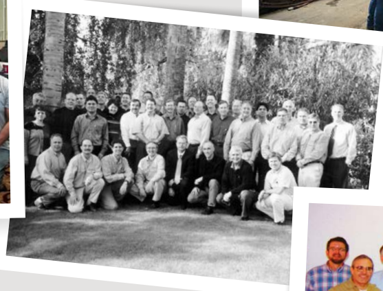
Several generations have had a hand in building our company.