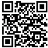
SEE MORE FROM OUR 90TH ANNIVERSARY CELEBRATIONS!

“For nine decades now, this company and its employees have helped meet the water-related needs of cities and municipalities across the nation. We have made a very real, tangible difference in the lives of communities, and that is a heritage we can all be justifiably proud of. It is the legacy we carry in our company genes.”