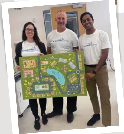
Carollo Cares is an employee-led initiative focused on inspiring young people and promoting STEAM education.