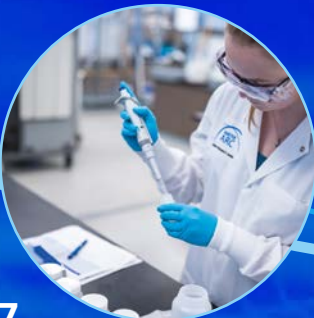
2017 Created Water ARC®, Carollo's applied research center, linking lab innovation to real-world application