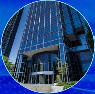
2022 Established our 50th office—the first office outside the continental US in Vancouver, Canada