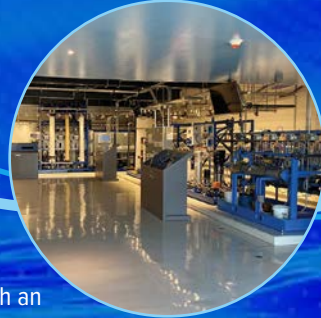
2022 Collaborated with an international team to evaluate AI and machine learning in making water purification more efficient