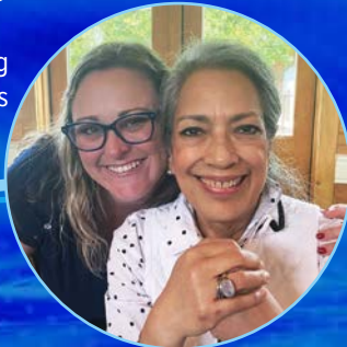
2018 Established the Employee Leadership program—inspiring and empowering current and future leaders at Carollo