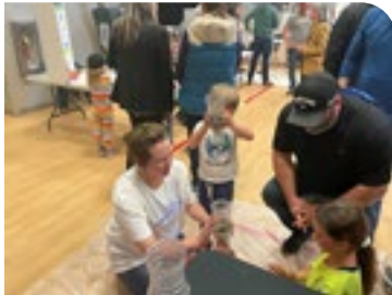
Tahoe Lake Elementary School.