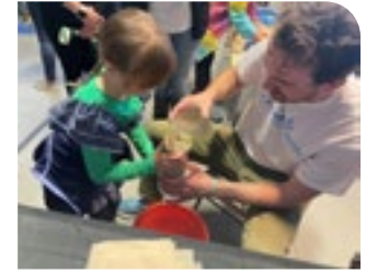
Truckee Elementary School.