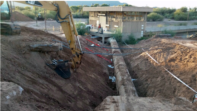
City of Phoenix, Verde Water Treatment Plant Facilities Demolition Project Phoenix, Arizona