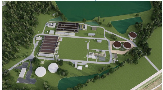
Bee Ridge Water Reclamation Facility (WRF) Expansion Sarasota County, Florida