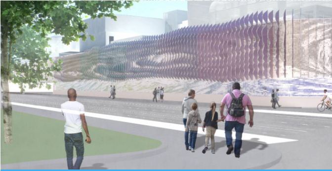
San Francisco Public Utilities Commission, CA Southeast Plant 250-mgd Headworks Facility San Francisco, California